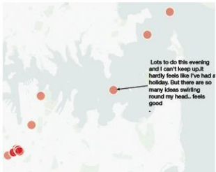
Figure 3: A second person tracking her thoughts. The visualization showed to the participant how some of her 'best' ideas occur on the sea, during her daily ferry commuting trips.

Apart from concerns about the confrontational experience, some students have reported in their write-up of their experience, we also wanted to encourage them to be more imaginative about the data they collect in this exercise and widen their gaze about the possibilities of such data practices. Members of the MDSI teaching team therefore experimented with an alternative to the more common forms of activity tracking (steps, calories, heart rate, sleep) that flips the idea of measuring human activity at regular intervals in that the data we attempted to measure at six pre-determined intervals each day were our thoughts.